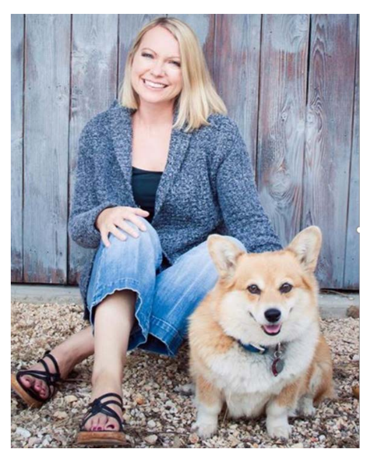
25|Page All Rights Reserved, Copyright, GVA Inc. 2021

Annuities are not for everyone, but for people who can use their benefits, they can be the perfect product.